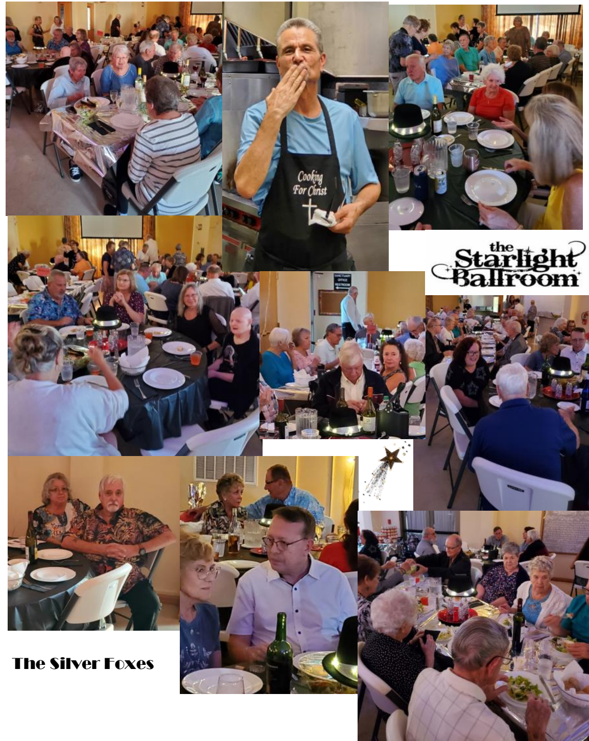
The Silver Foxes

Fellowship is all about fun, friendship, love and calories!