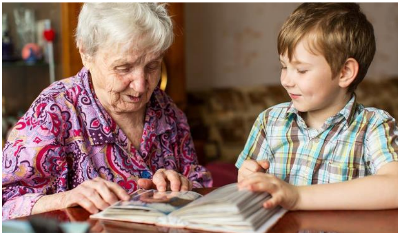
Proverbs 16:31: God values the wisdom and righteousness of the aged.

We are blessed to have such a thoughtful, experienced and motivating generation with us who is always there for us to guide us.